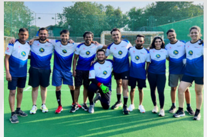
Team Vahura at IDIA Football League, 2024, Mumbai

Further, we were honoured to partner and collaborate with Law Foundation , an organisation that works towards building capacity and is committed to