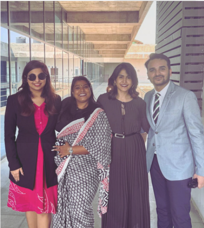
Team Vahura on campus for a Mock Interview Engagement

The last financial year was an interesting one for the Vahura Mentorship & Navigator vertical, which serves as the bridge between law schools and the legal industry. We provide mentorship and consulting services to help students and young professionals transition comfortably into employment post their law school journey. Our carefully designed programmes equip students with the skills and tools necessary to chart their course to success. We also work with law schools to help them create job-ready graduates.